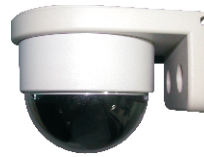
Wall-Mount Bracket for Model-B